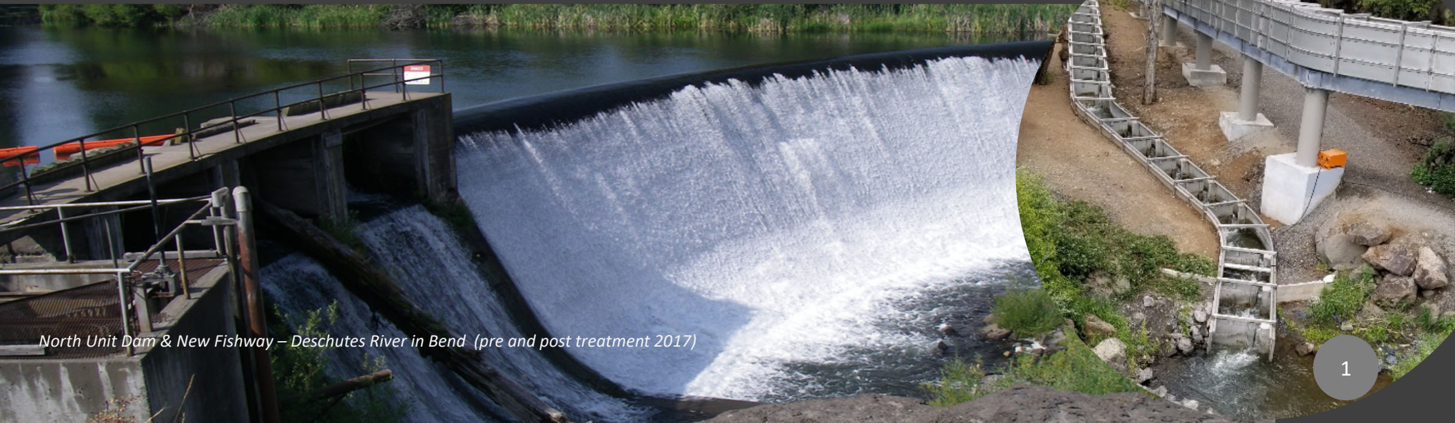
North Unit Dam & New Fishway – Deschutes River in Bend (pre and post treatment 2017)

Dec. 16, 2022 Oregon Fish & Wildlife Commission Meeting